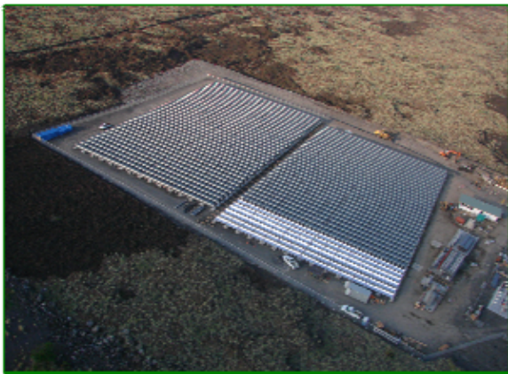
Sopogy Kona Solar Field

economically store its solar thermal energy to extend power production beyond the solar day or to shift power delivery to the period of greatest value to the customer. To accomplish the same feat, PV is forced to rely on battery storage, which is still cost prohibitive for large-scale applications. Finally, MicroCSP systems can also be paired with a back-up boiler to guarantee firm and reliable power delivery 365 days per year.